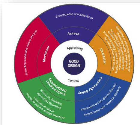
Figure 2: Objectives of good design

7.1 The purpose of a Design and Access Statement (DAS) is to provide a clear and logical document to demonstrate and explain the various facets of design and access in relation to the site. The DAS also acts as a method of demonstrating the details of a planning application in a way that can be read both by professionals and the public. The diagram below, extracted from the Welsh Government guidance on preparing a DAS, illustrates the various considerations that need to be taken into account when preparing such a document.