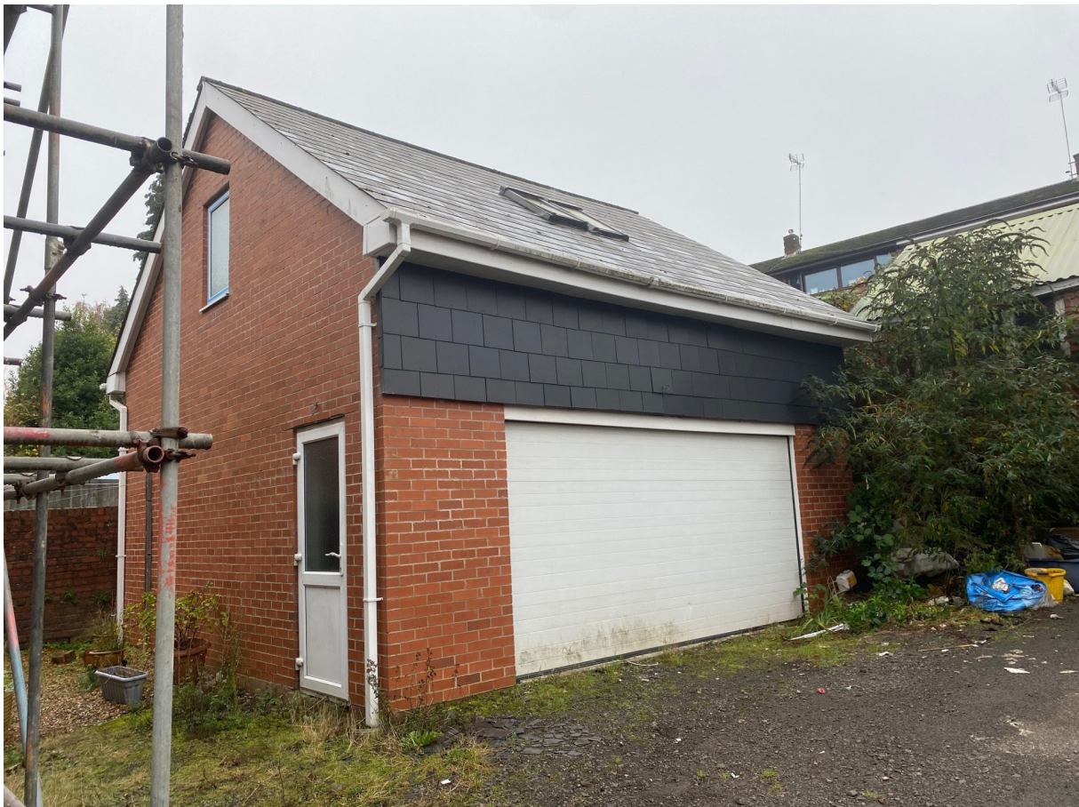
Photo showing the existing Garage

All utilities and services e.g. drainage, water and electricity already run to the garage.