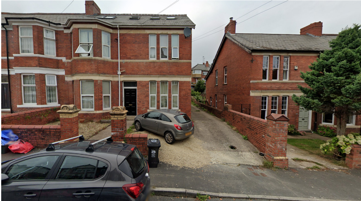
Photo showing the existing drop kerb and access to the existing carparking at the rear of 52Bryngwyn Rd

The garage is accessed via an existing hard standing drive down the side of 52 Bryngwyn Road, which remain unchanged.