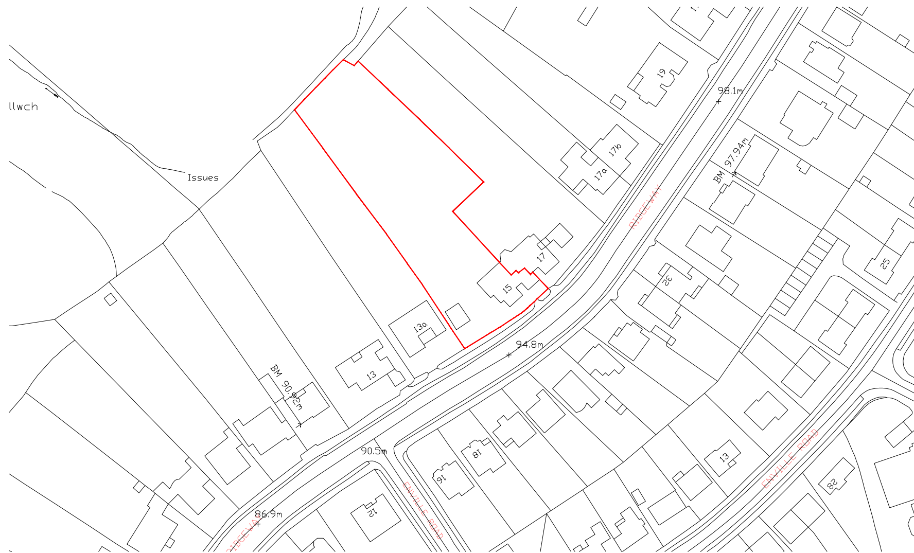
SITE LOCATION PLAN 1:1250 @ A3