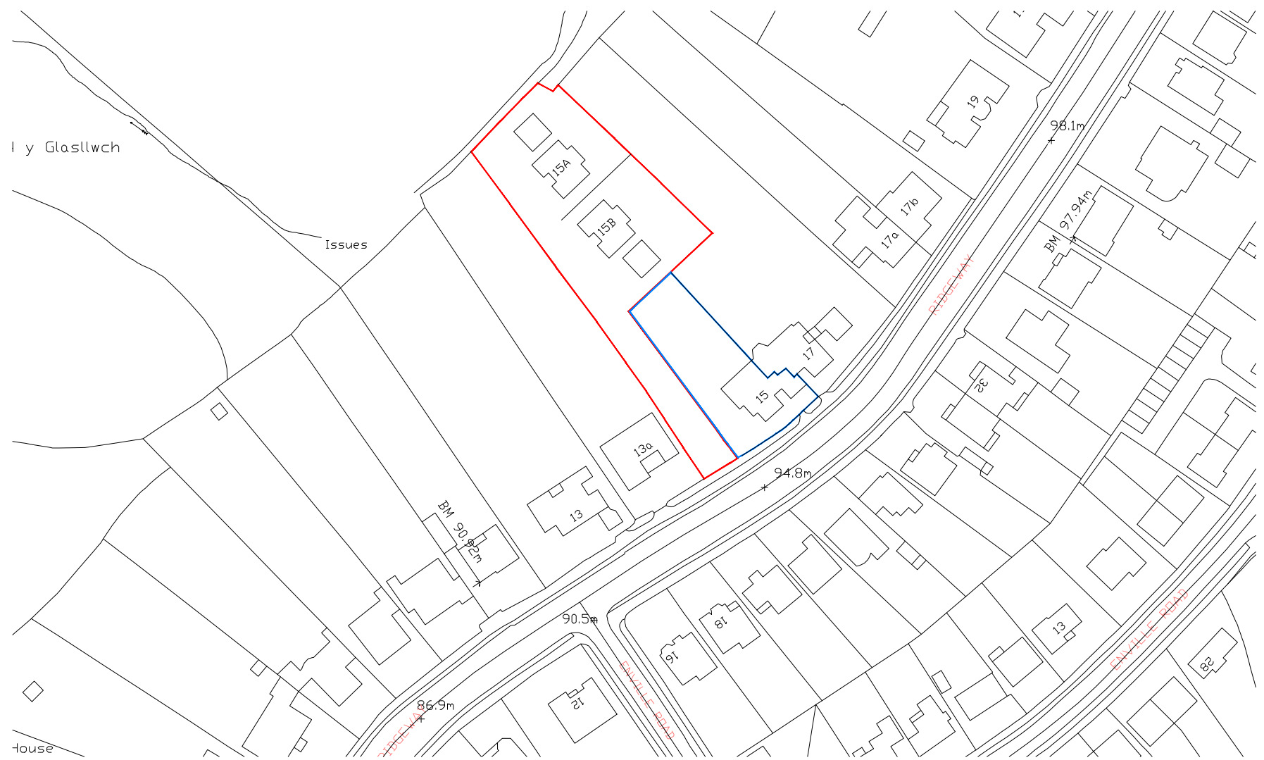
SITE LOCATION PLAN 1:1250 @ A3