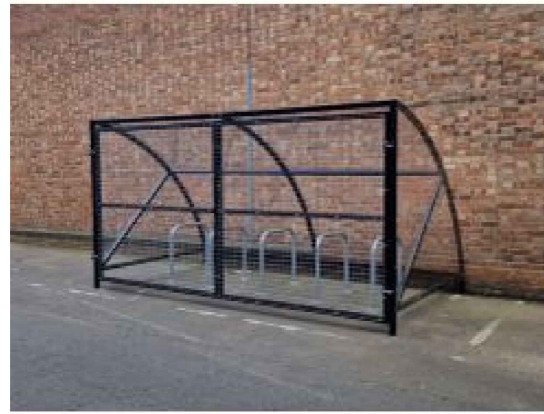
External bicycle store - 2.1m deep x 3.1m long (8 bikes) x 2.15m high with Sheffield stands & gated access