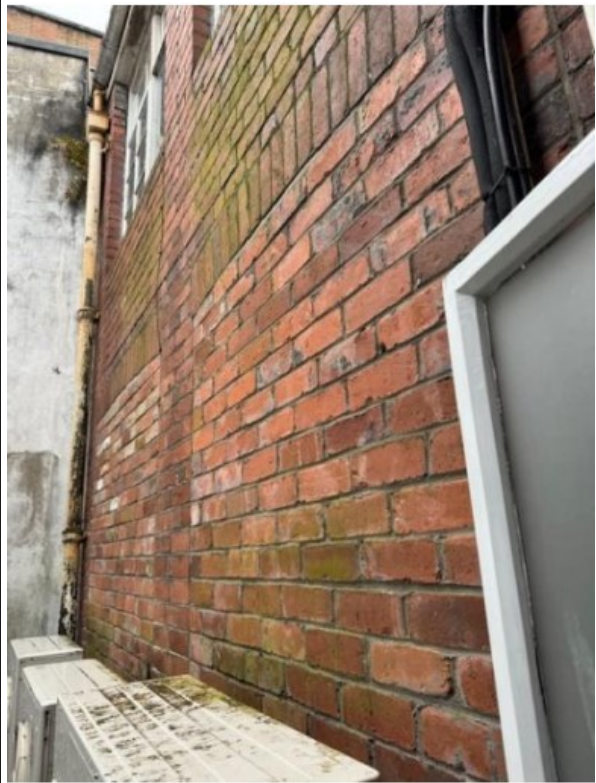
Rear Courtyard photo showing where existing window will be blocked up and 2No swift boxes provided. (Top left hand corner.)