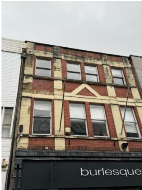
Front Elevation – Photo.