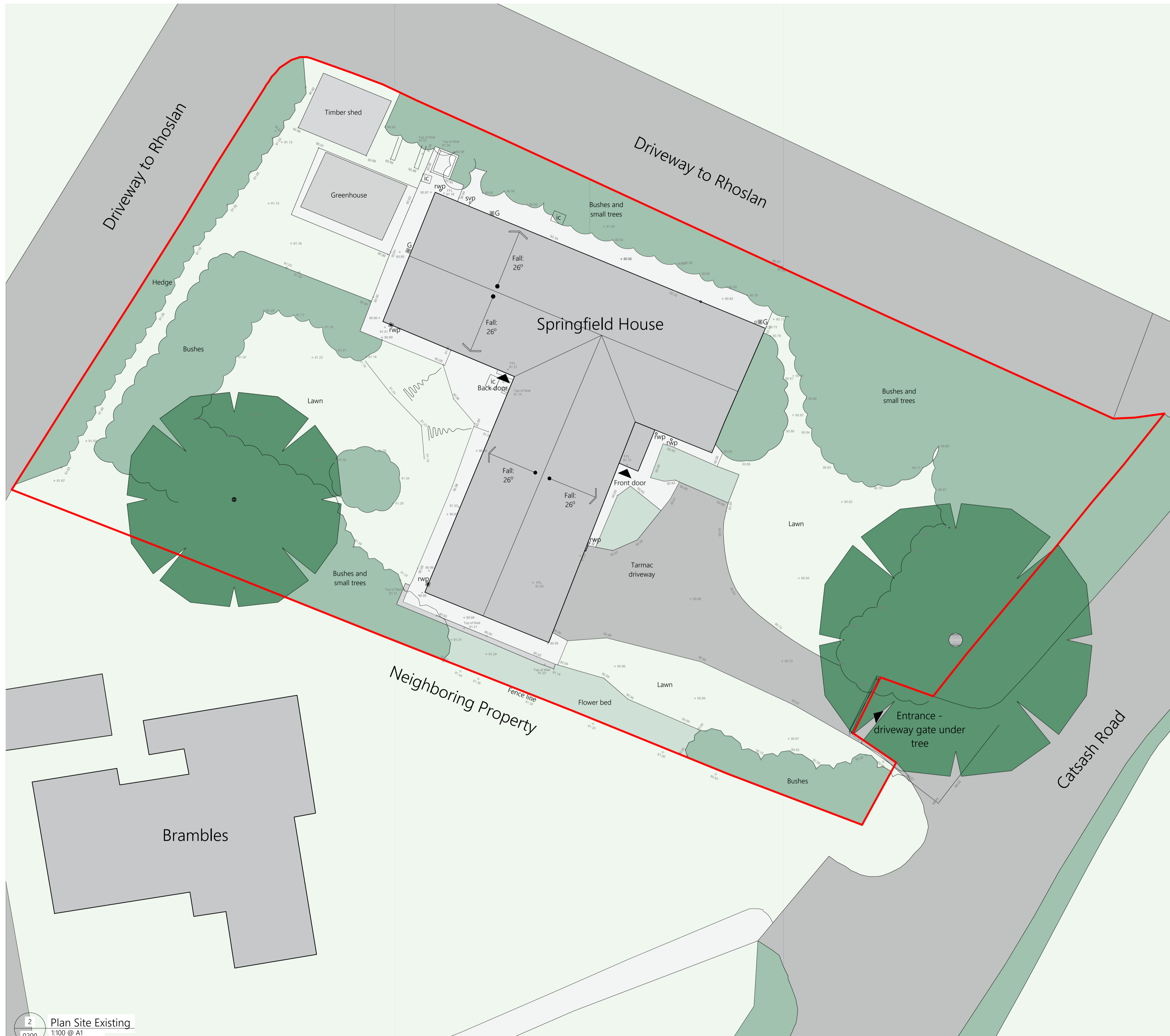
2 0200 Plan Site Existing 1:100 @ A1