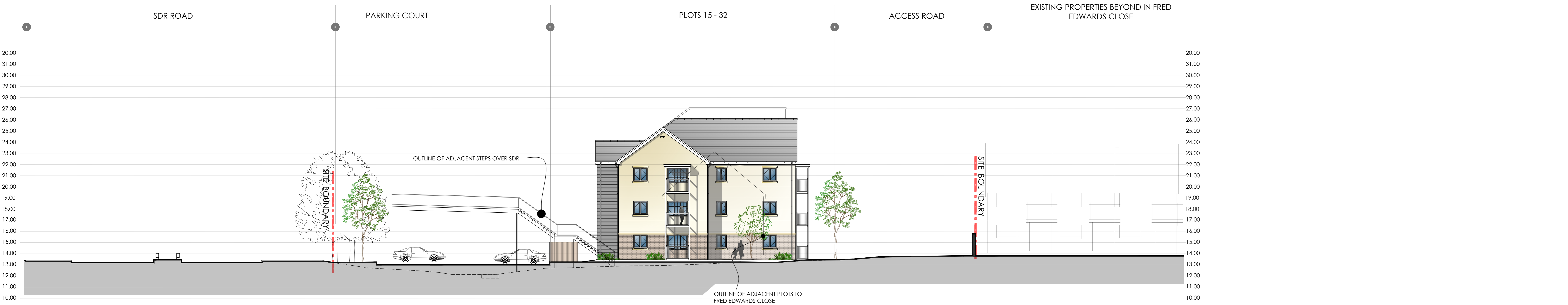
SITE SECTION 5