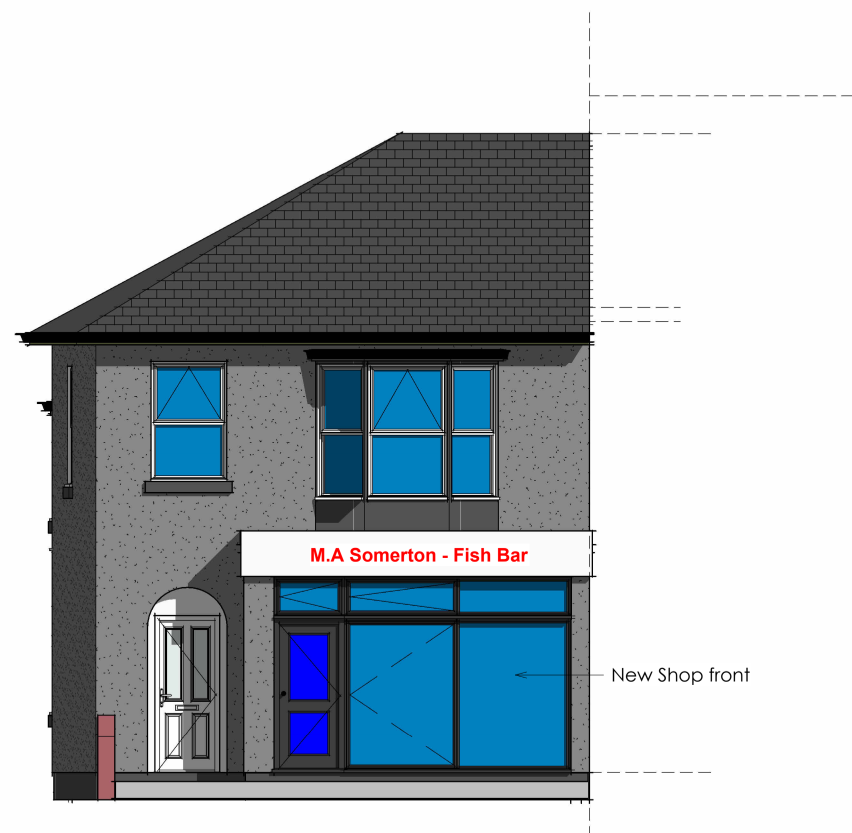
1 Front Elevation