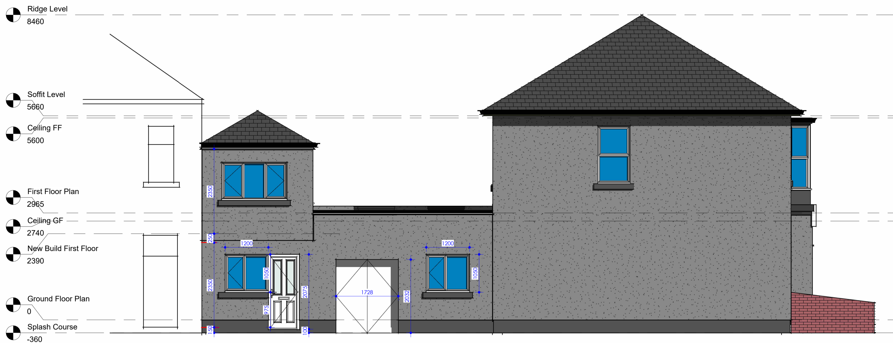
3 Left Side Elevation