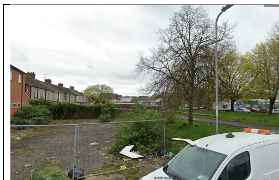
Google streetview April 2023

The extent of hard surface now appears to extend to the red line boundary to the north. As highlighted previously note the presence of a semi-mature tree (possibly highways) in the grass verge. There is no topographic survey to locate this but roots will be affected and a professional Tree Survey to BS5837 is now required. Please highlight to the Tree Officer and Highways.