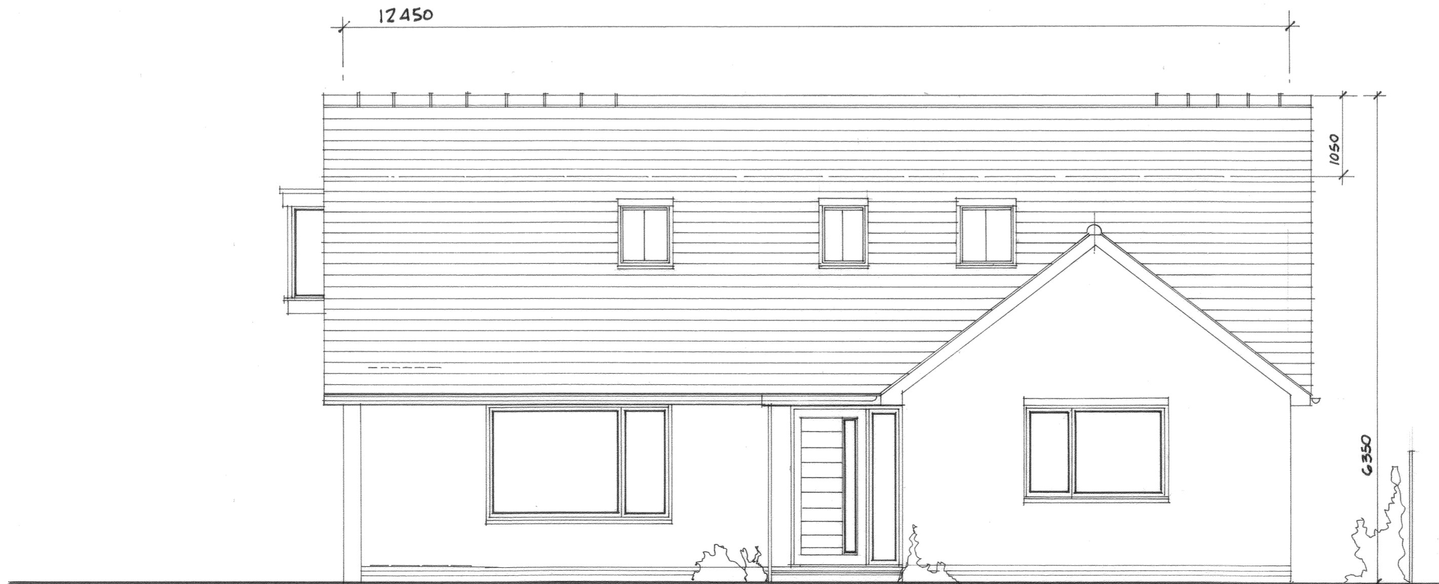
SOUTH WEST ELEVATION AS PROPOSED.