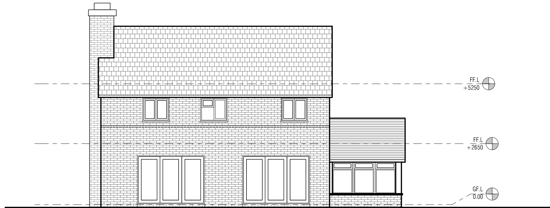
EXISTING ELEVATION C