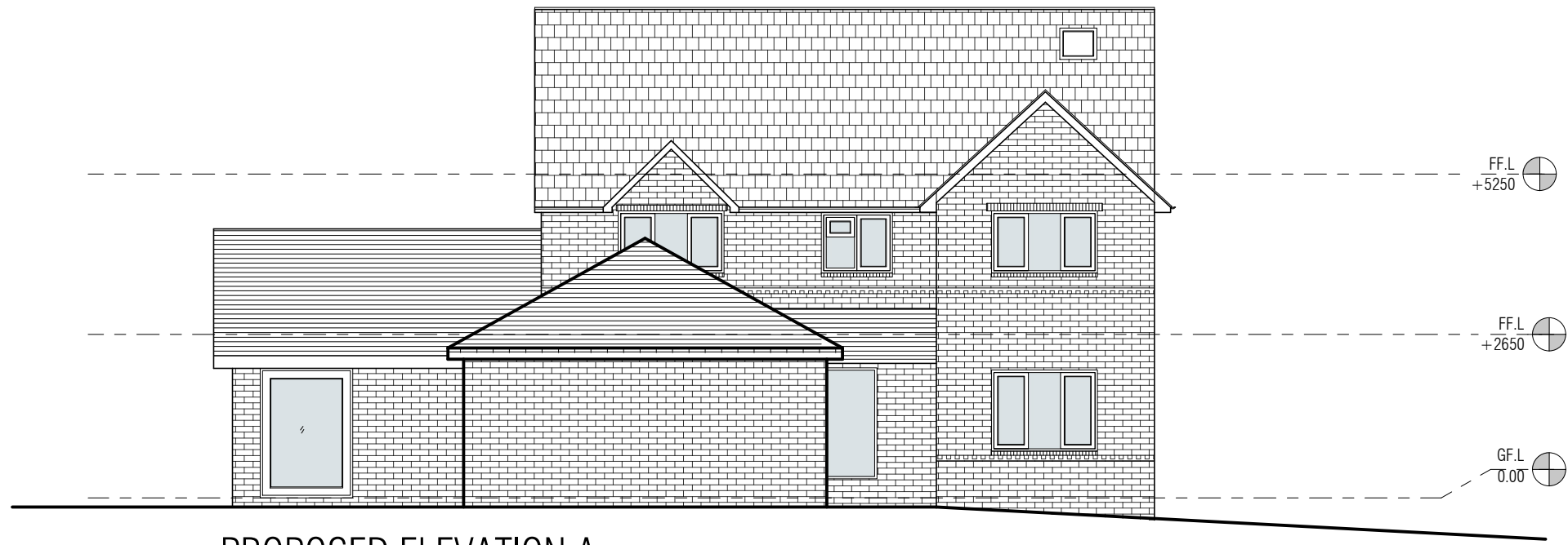
PROPOSED ELEVATION A