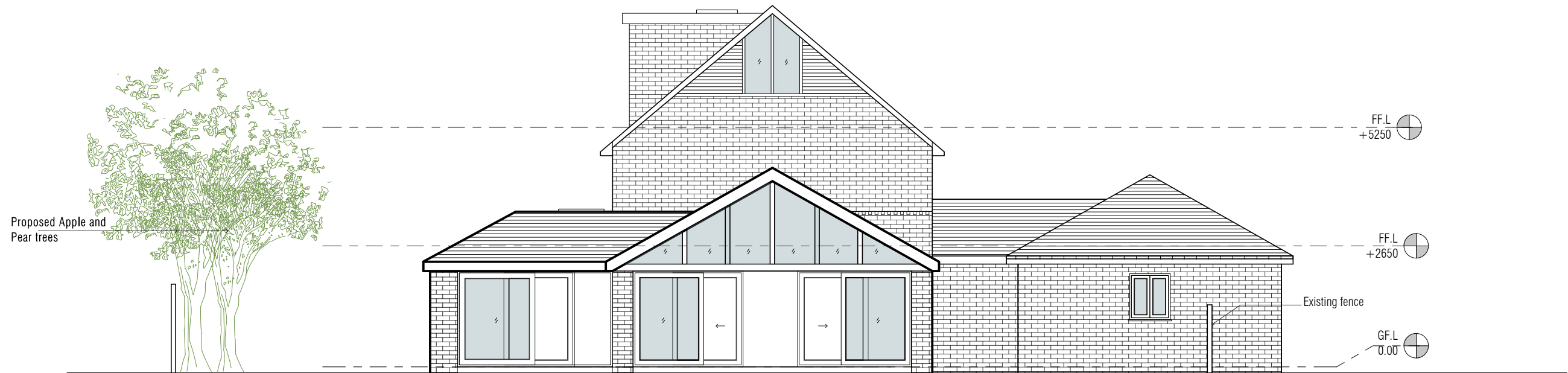
PROPOSED ELEVATION B