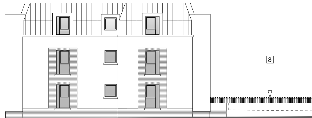
Elevation to Kelvedon Street ( South East Facing )