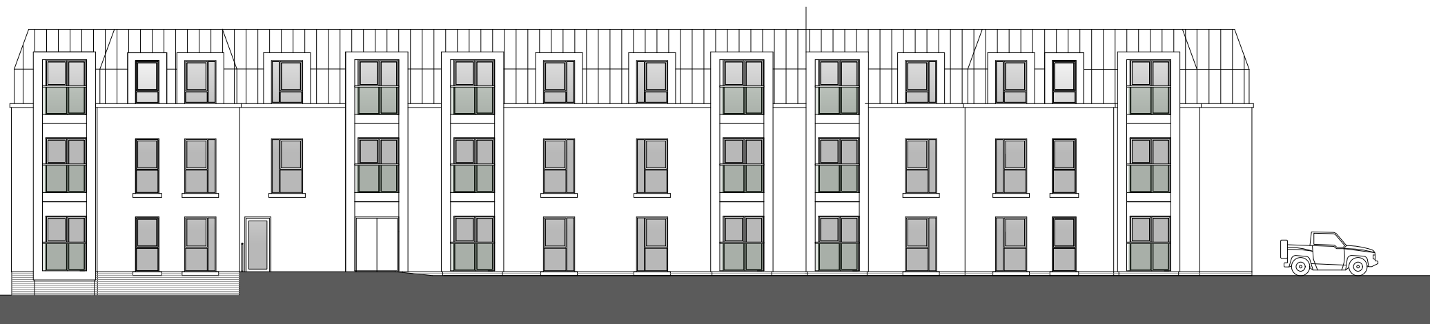
Elevation to Parking ( North East Facing )