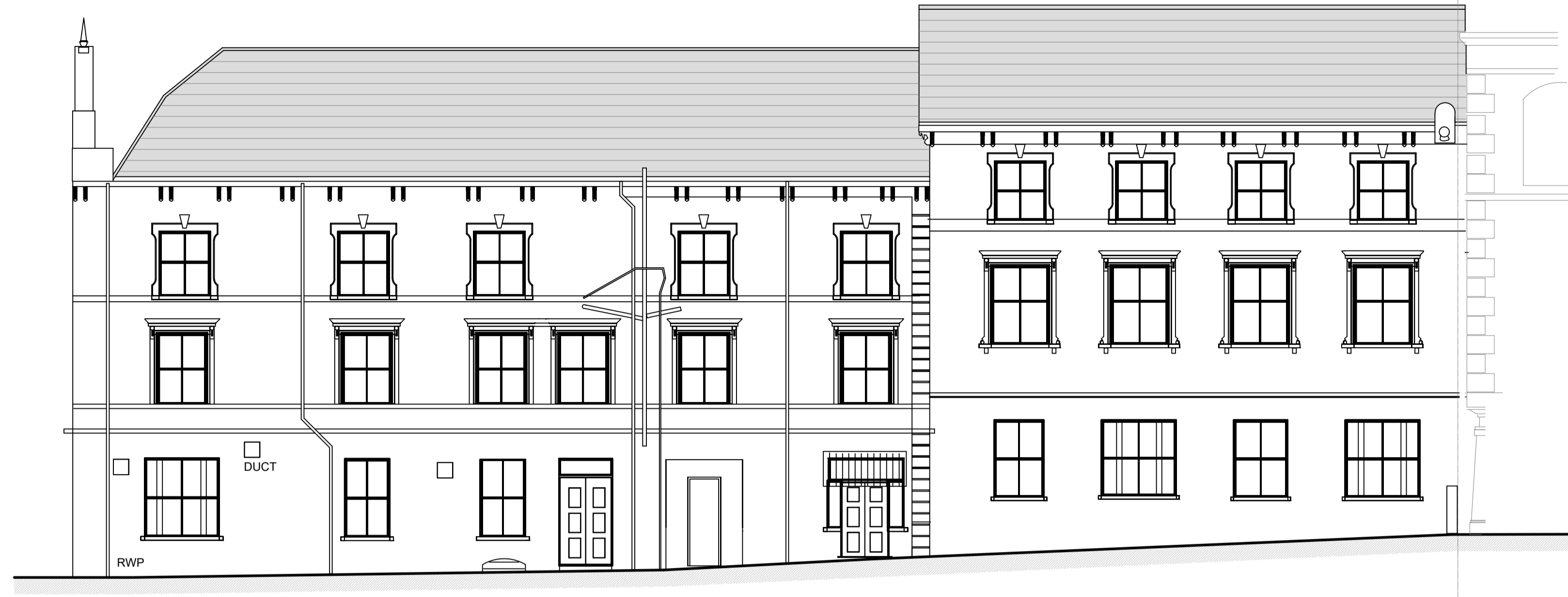
Bridge Street Elevation (2)