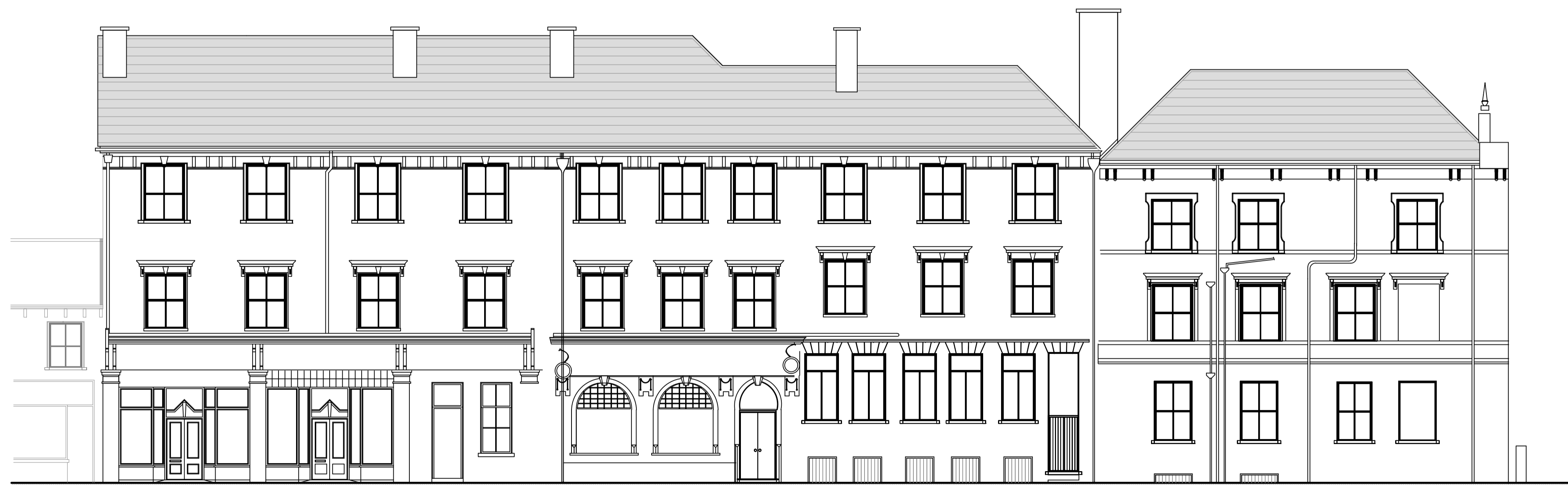
Baneswell Road Elevation (3)