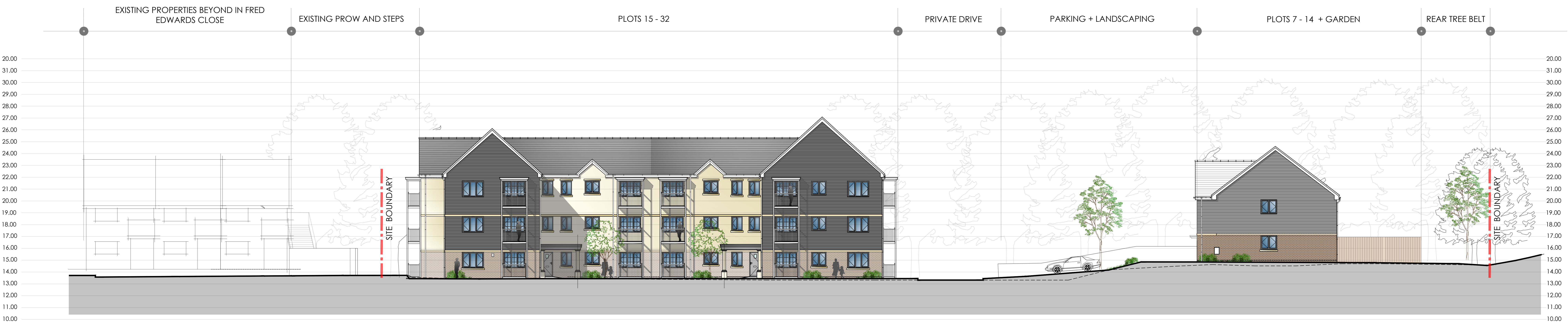
SITE SECTION 2