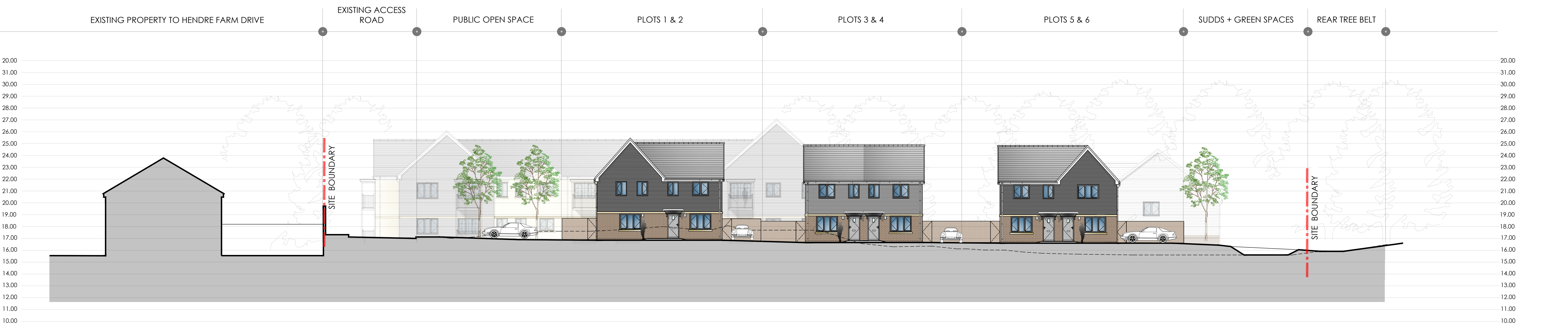
SITE SECTION 1

Do not scale from this drawing. The status of this drawing shall only be confirmed by the architect. This drawing is copyright. It must not be reproduced, stored in a retrieval system or transmitted in any form or by any means, without prior permission of the architect.