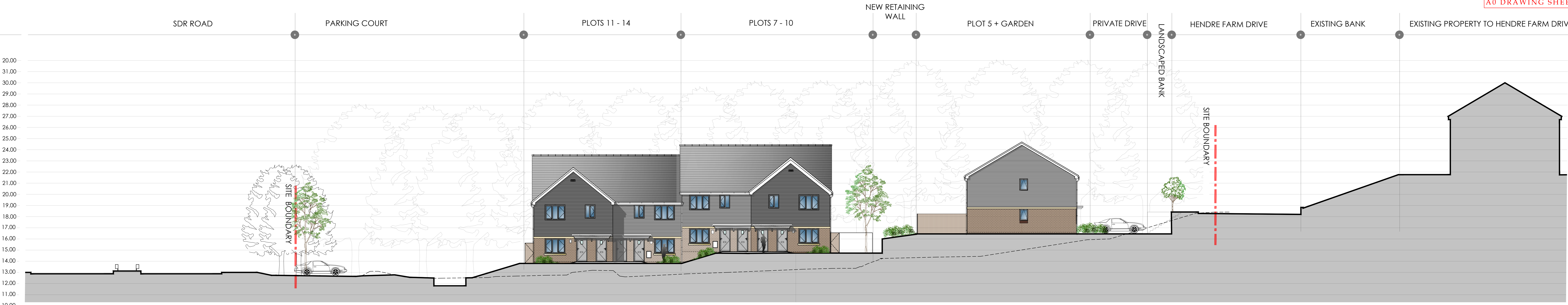
SITE SECTION 4

Do not scale from this drawing. The status of this drawing shall only be confirmed by the architect. This drawing is copyright. It must not be reproduced, stored in a retrieval system or transmitted in any form or by any means, without prior permission of the architect.