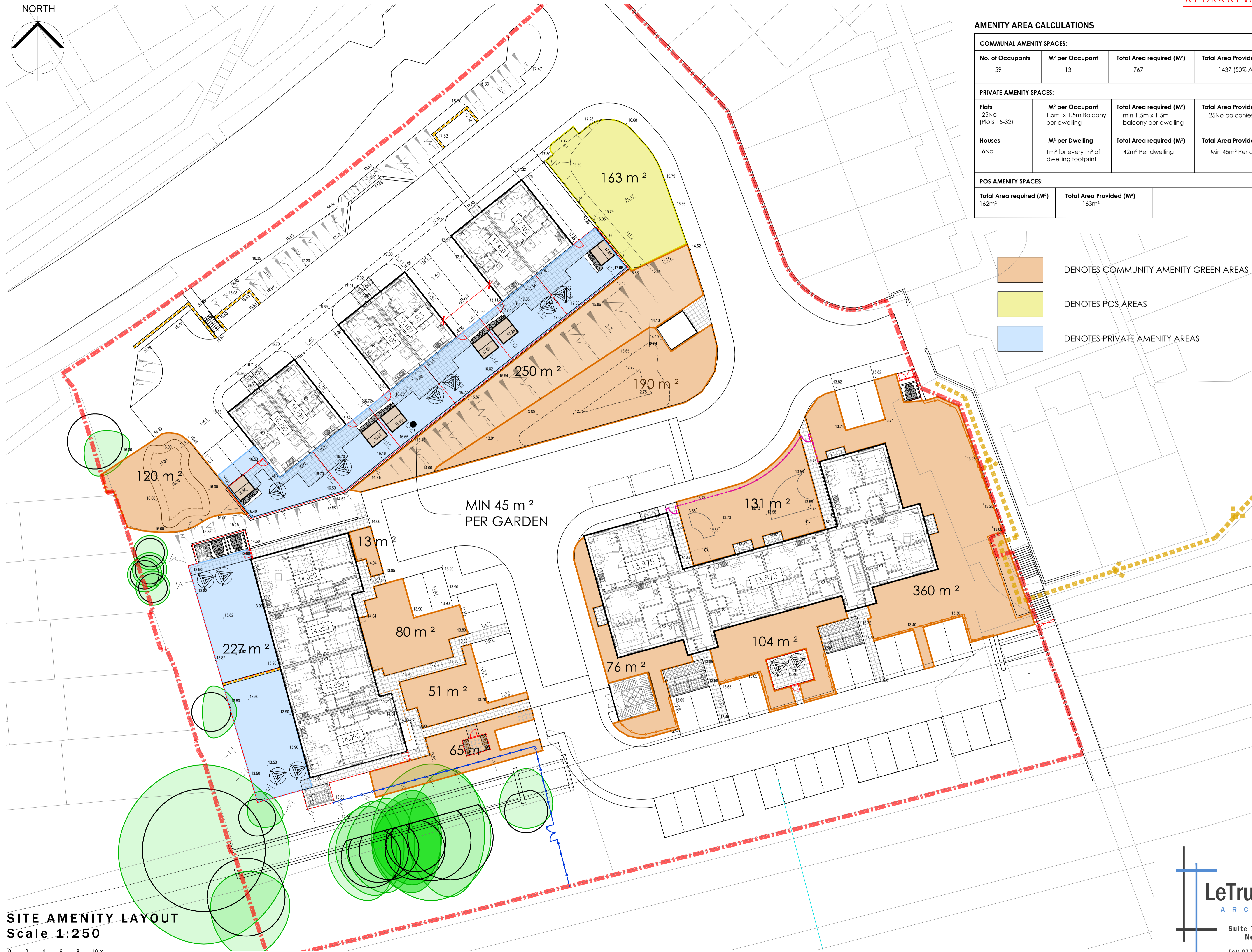
SITE AMENITY LAYOUT Scale 1:250