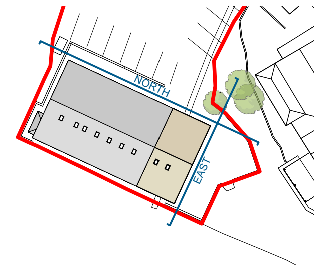
Proposed Key Plan Scale: 1:500