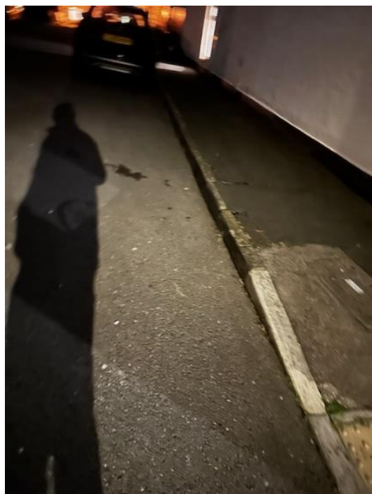
Leicester Road available parking