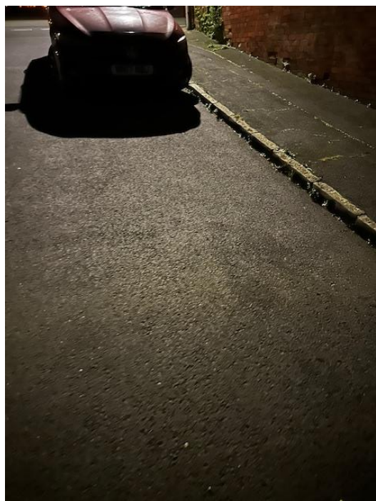
Ronald Road available parking