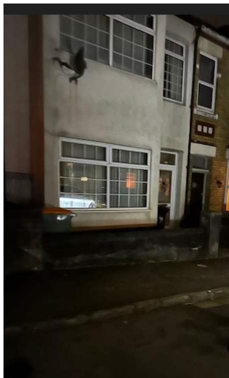
Somerset Road available parking