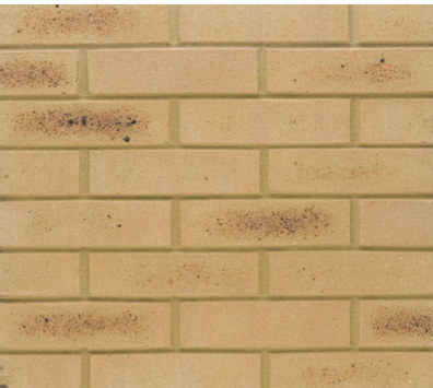
8. Weinerberger Kemsley Yellow Dragfaced (or equal approved)