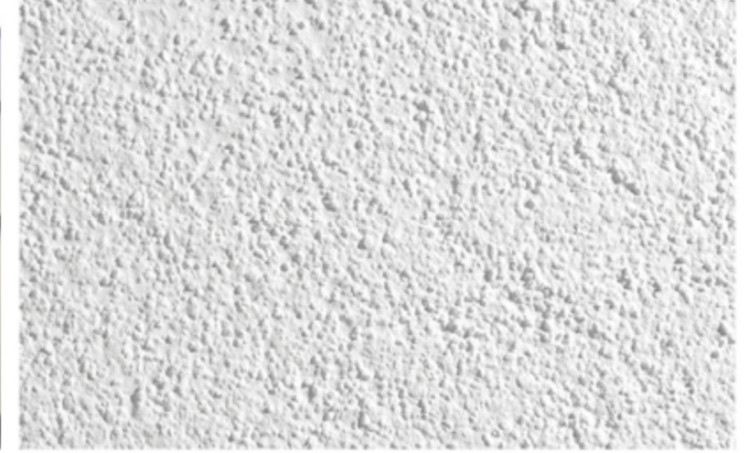
6. Parex Monorex "G00 Natural White" Render (or equal approved)