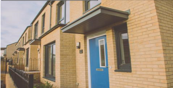
9. Stormking GRP Door canopies 10. IG SBD Steel Doors "XD79"

Herbert Road Re-Plan – Residential Development Proposed Material Schedule Sheet: MaterialsV1/HR