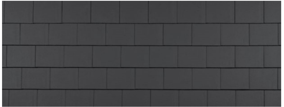
3. Russell Galloway "Anthracite" Roof Tile (or equal approved)