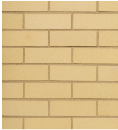
2. Weinerberger Staffordshire Smooth Cream (or equal approved)