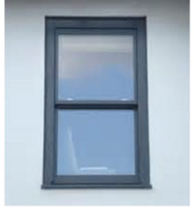
7. UPVC Colour Bonded – 7106 Antracite Grey