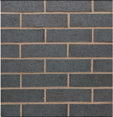
5. Weinerberger Staffordshire Blue Dragfaced (or equal approved)