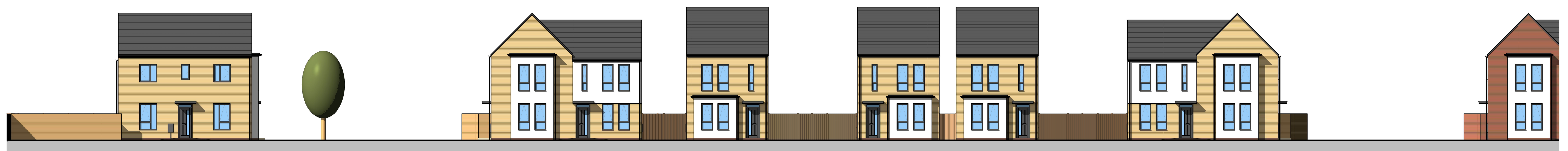
Plot 48, 49-55, 125