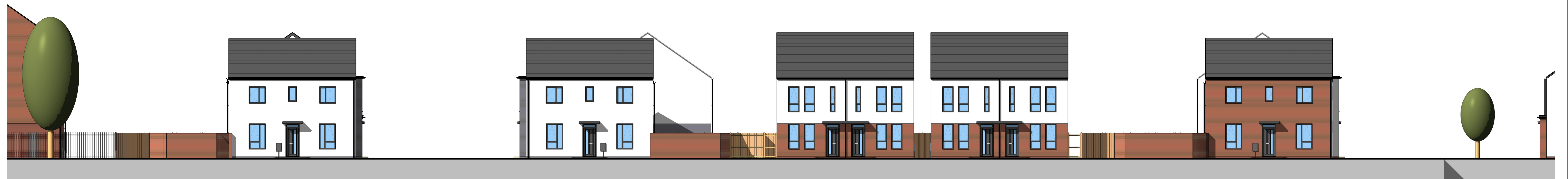
Plot 91-96, 109-125, 192