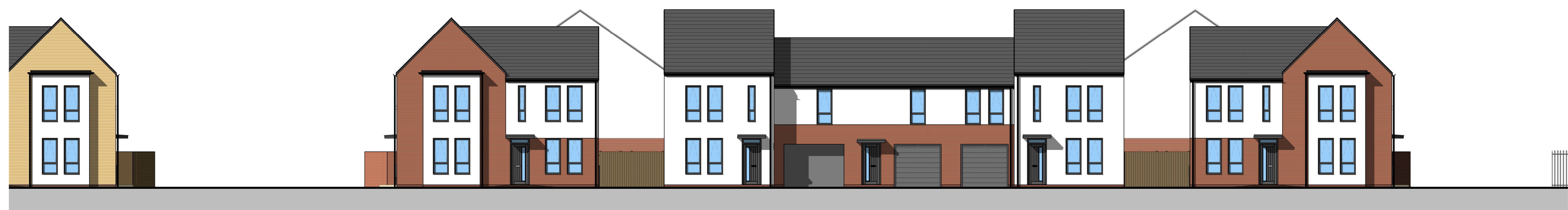
Plot 55, 125-131