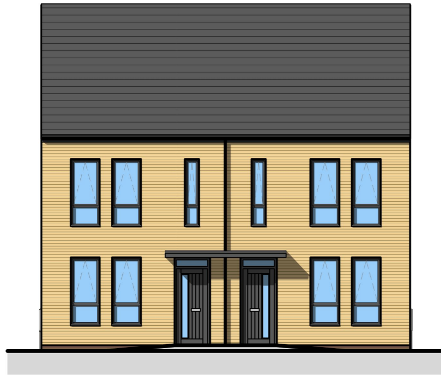
Front Elevation Elevations - Type.1 House Type 'A'

Tregleath House, 1 Serpentine Road, Newport, South Wales, NP20 4PF Tel: 01633 254711 www.eosarchitects.co.uk