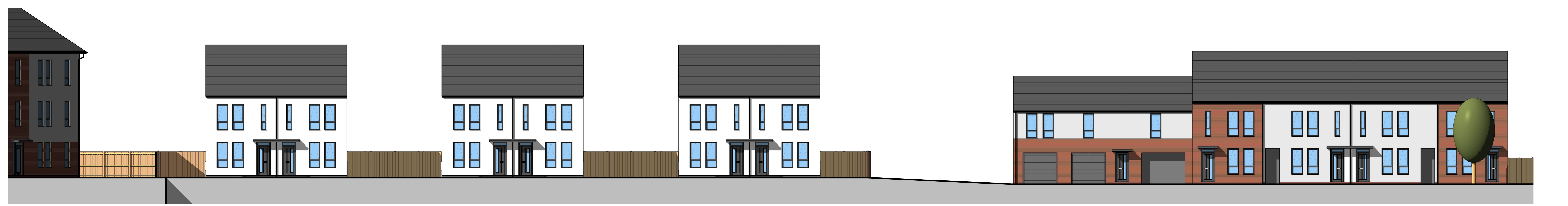
Plot 169-177, 178-188