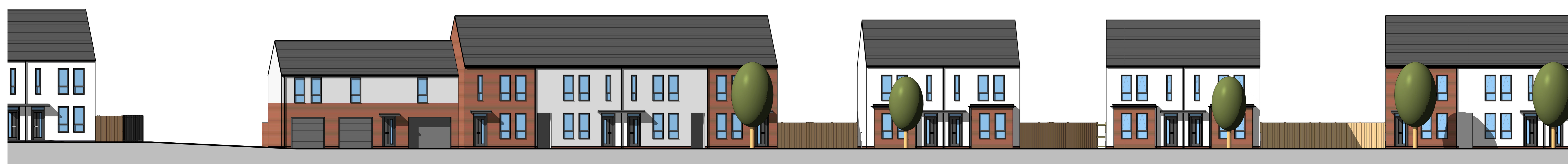
Plot 182-183, 187-195