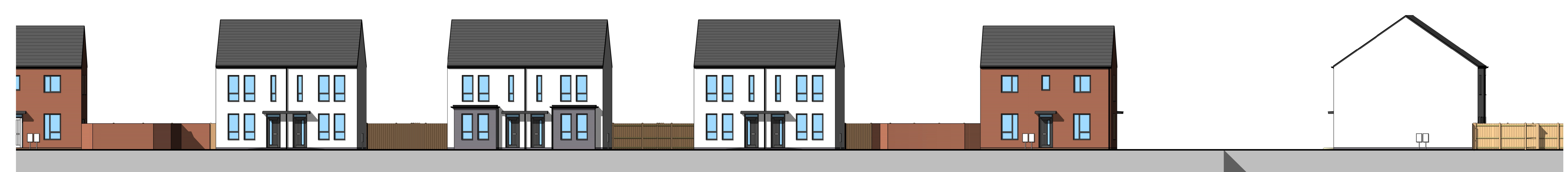
Plot , 132-137, 164, 181