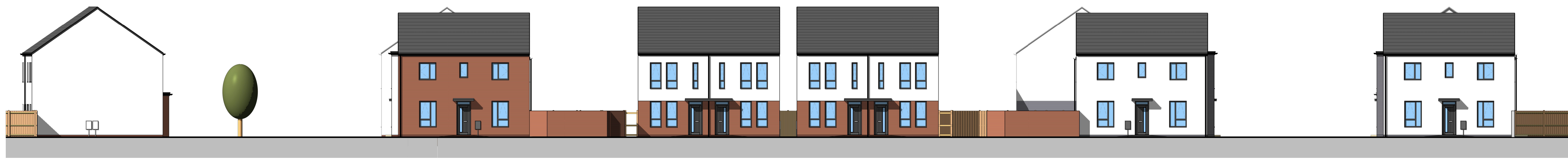
Plot 169, 116-131, 103

Do not scale from this drawing. Refer to figured dimensions only. The Contractors shall check all dimensions and report all errors and omissions to the Architect.