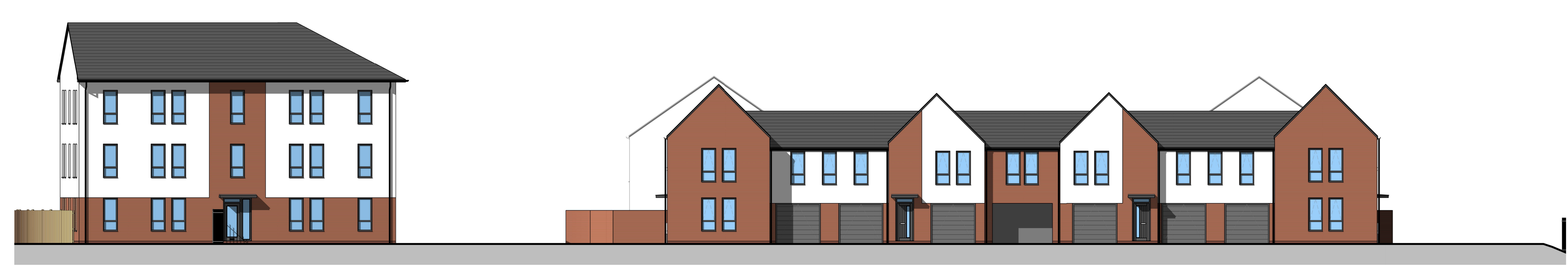
Plot 149-157, 138-142