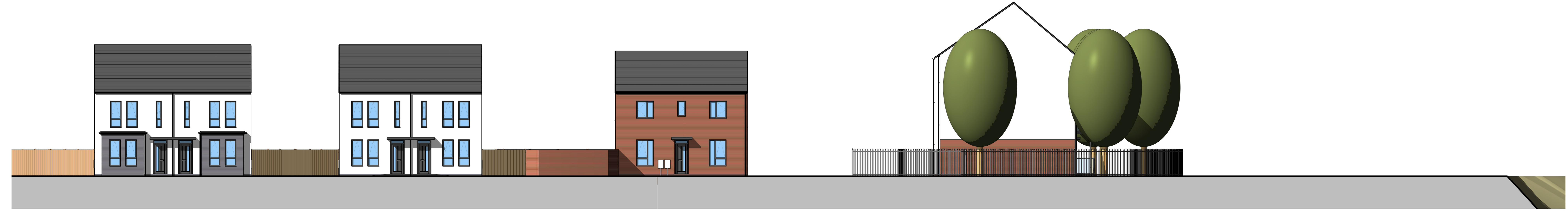
Plot 158-161, 142, 143-148