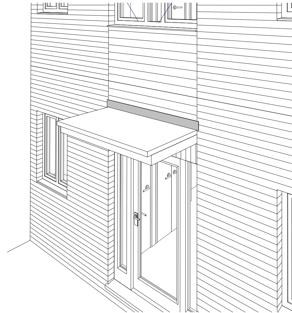
Indicative Canopy Visual

Finishes are to match as best as possible colours of main roof and fascia system. (charcoal grey).