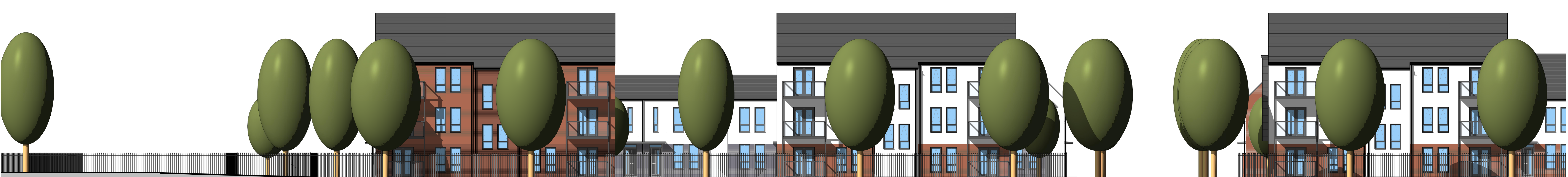
Plot 94-99, 88-93, 82-87