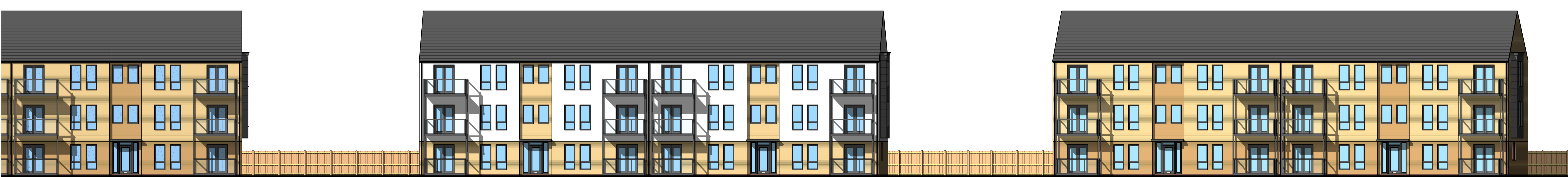
Plot 25-36, 13-24, 01-12 STREET SCENE ALONG RIVER FRONT