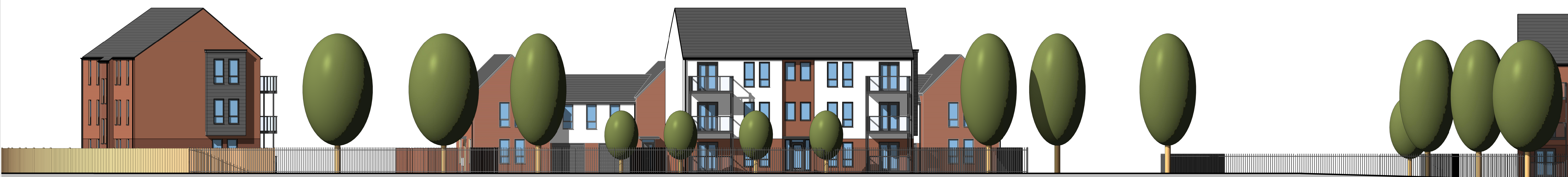
Plot 144-149, 138-143, 94-99

Do not scale from this drawing. Refer to figured dimensions only. The Contractor shall check all dimensions and report all errors and omissions to the Architect.