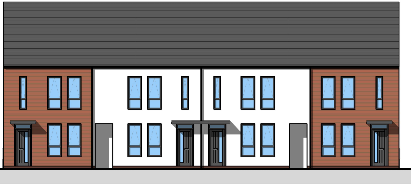
Front Elevation Elevations House Type 'B'