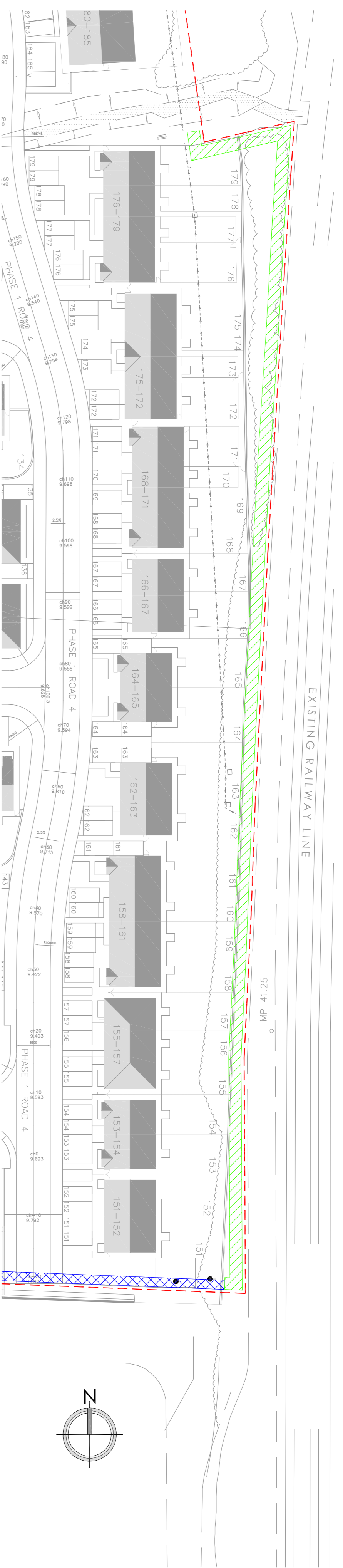
SITE PLAN SHOWING EXTENT OF REINFORCED EARTH BANK (SCALE 1 : 750)