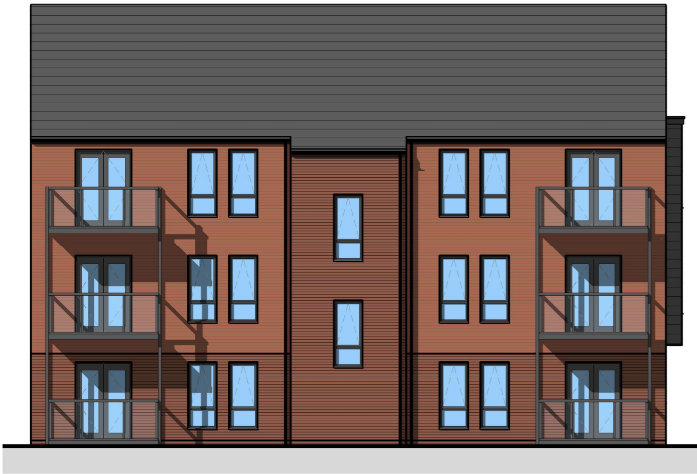
Front Elevation Elevations - Type.2 House Type 'K'