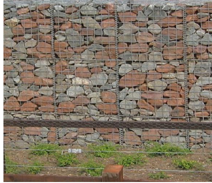
Red & Grey Granite