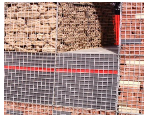
Engineering Brick & Grit stone