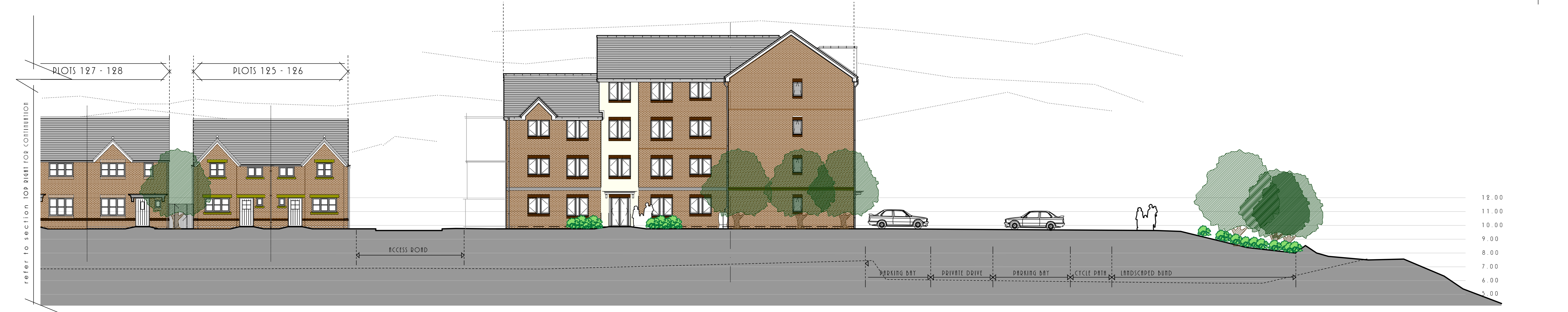
STREET ELEVATION 5 - Opposite Reen