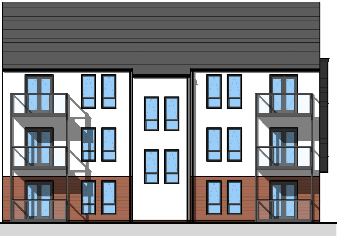
Front Elevation Elevations - Type.1 House Type 'K'

Tregleath House, 1 Serpentine Road, Newport, South Wales, NP20 4PF Tel: 01633 254711 www.eosarchitects.co.uk