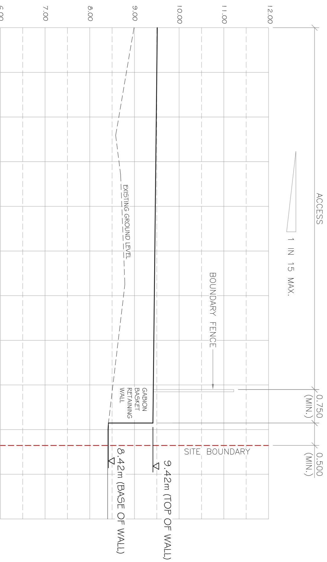
SECTION J - J (GABION BASKET WALL) (SCALE 1:50)